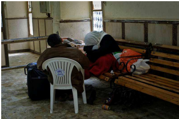
An exhausted family waits for papers that will allow them to leave the no man's land between Egypt and Libya. / March 2011