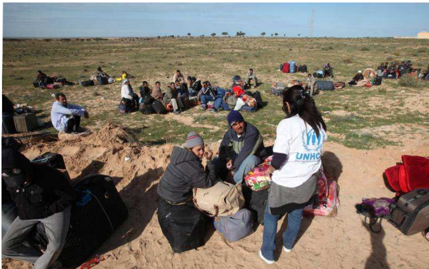
UNHCR staff on the Tunisian border help to identify anyone in need of refugee protection.

The Regional Inter-Agency Flash Appeal for the Libyan Crisis requesting total of USD 160.3m in funding for March-June will be revised within two weeks to update scenarios, needs and funding requirements. Currently the appeal is 48% funded.