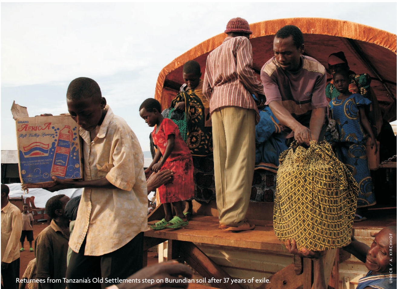
Returnees from Tanzania's Old Settlements step on Burundian soil after 37 years of exile.

UNHCR planned to facilitate the voluntary repatriation to, and reintegration in Burundi of, some 55,000 refugees from neighbouring countries. It also aimed to support the establishment and smooth functioning of new Government bodies responsible for refugees and returnees. Furthermore, the Office sought to ensure the protection of refugees and asylum-seekers as well as provide material assistance and basic services to camp-based refugees.