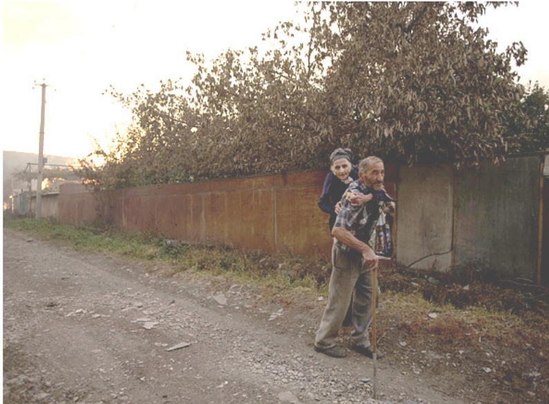
An elderly Georgian couple escapes from a house set on fire in Kvemo-Achebeti.

the parties to the conflicts and peacekeeping forces were deployed to monitor these agreements, but peace remained elusive.