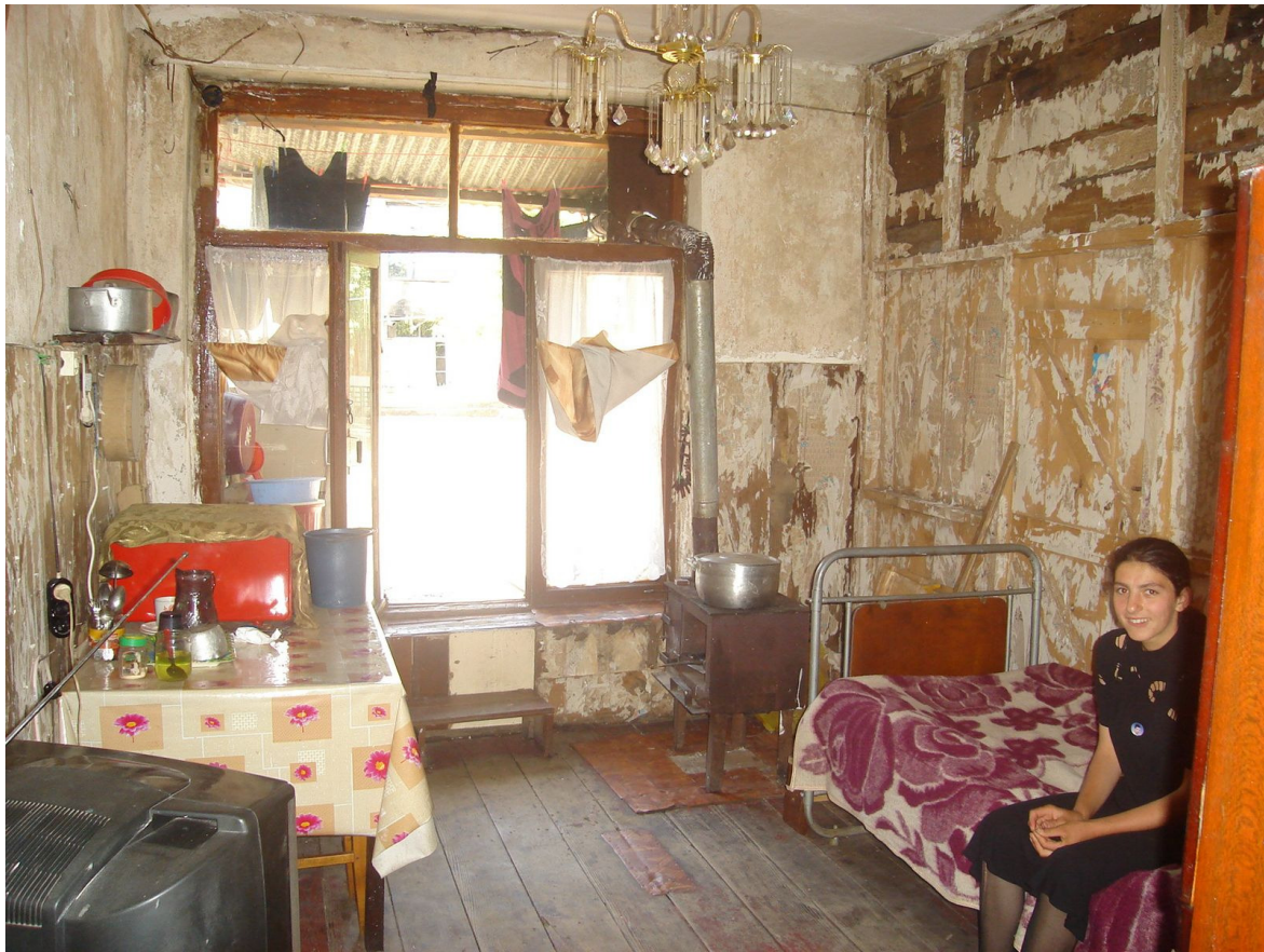
Back cover: In one of the IDP collective centres in Zugdidi.