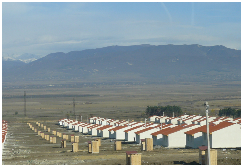
Georgia Health Cluster . WHO Bulletin No. 4, 9 December 2008. (photo by Sintija Smite).

New IDP settlements provide virtually no social infrastructure, and access to essential services is not offered yet to the population resettled in these areas. There are no pharmacies, health facilities or grocery stores nearby, though schools are planned to be built on the settlement premises. Some of the settlements (Koda) have no hospital, dispensary, drug store or ambulance station. Others have outside wooden latrines which are to be shared by several households - an issue particularly problematic in the winter season, to say nothing of the sanitary considerations.