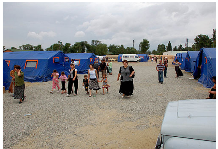
Tent camp in Gori, September 2008, Photo: InterPresNews http://www.civil.ge/geo/category.php?id=87&gallery=33&phot

While the first two rounds of the UN-OSCE-EU facilitated Geneva talks between parties in conflict were leading nowhere and blocked by procedural disagreements, the third and fourth round held on December 2008 and February 2009, moved to address some substantive issues and focused on conflict prevention and resolution mechanisms. Participants agreed in principle on broad terms of issues and implementation mechanisms, and eventually achieved certain progress, on February 17, 2009, agreeing on "Proposals for joint incident prevention and response mechanisms." 18