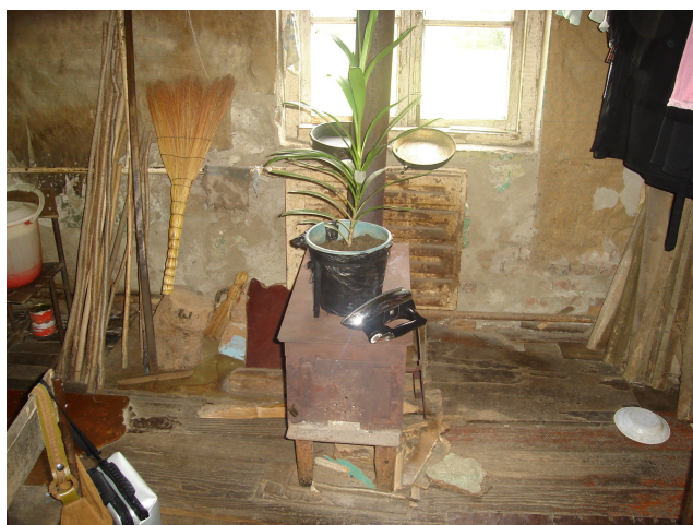
A typical living room in a collective centre, Zugdidi. (from the ICRC archive).

A rather specific issue related to education is the existence of IDP schools (subordinated to the Ministry of Education of the Abkhaz Government in Exile), even though their number has been dramatically reduced during the last several years. Different regions have traditionally different approaches to education for IDPs, with the highest concentration of separate schools (or separate shifts in the same school buildings) for IDP children in Samegrelo. Sometimes such schools are located in buildings that are now used as collective centres, which were built for non-residential functions but that were never intended to be used for education either. In other cases, they use the same building as ordinary schools, but operate in the second shift, in the afternoon. IDP schools are generally under-funded, the buildings need urgent repair and there is a lack of necessary equipment, as well as teaching and learning materials, which all negatively impact on the quality of education and the psyche of children.