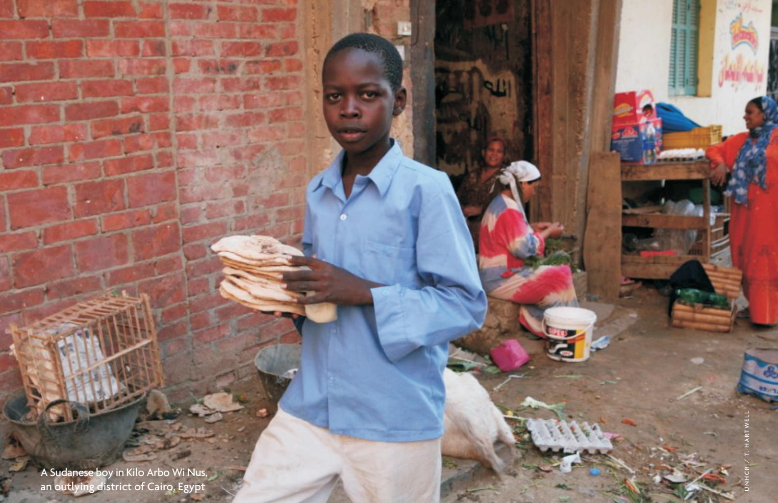
A Sudanese boy in Kilo Arbo Wi Nus, an outlying district of Cairo, Egypt