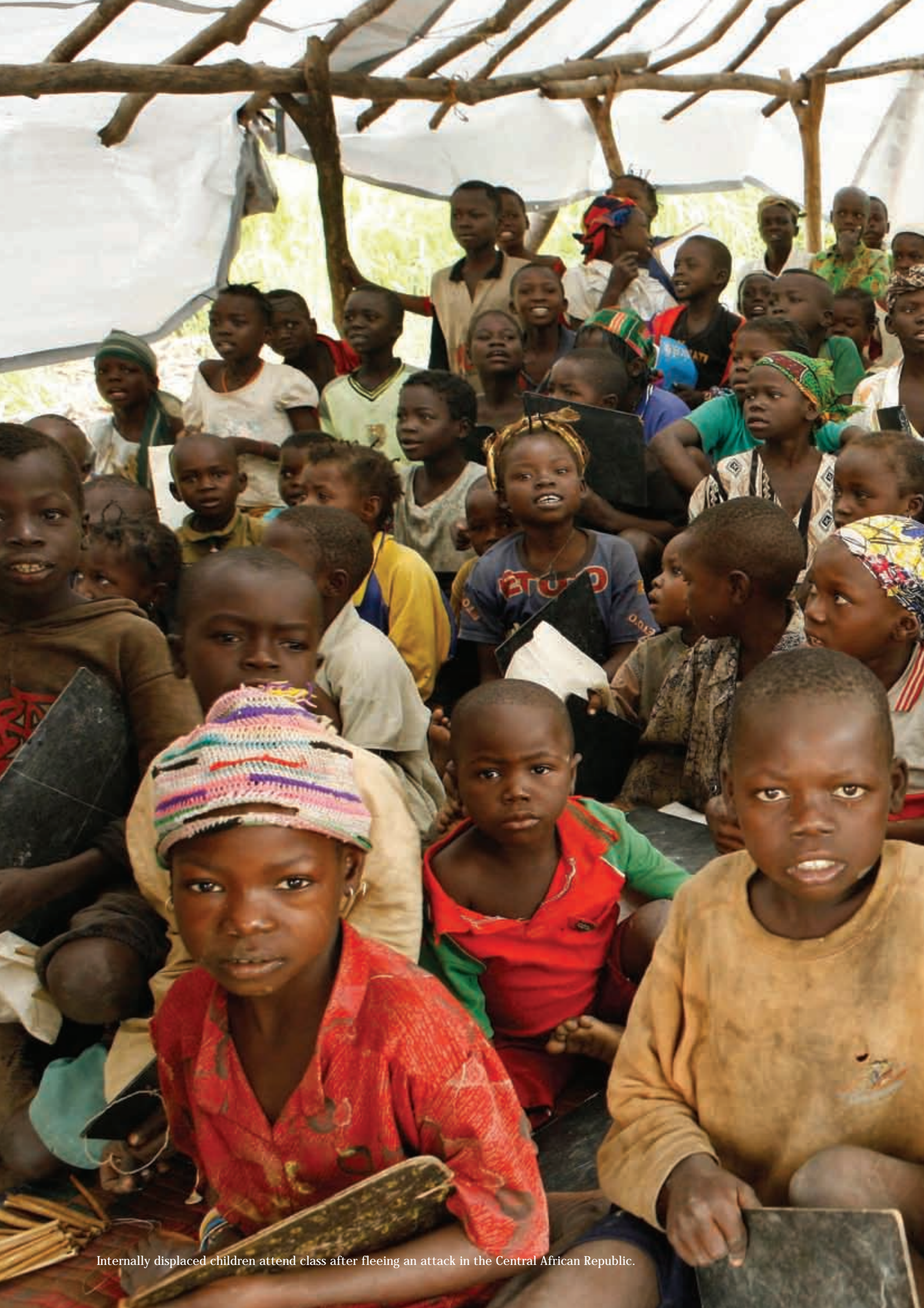
Internally displaced children attend class after fleeing an attack in the Central African Republic.