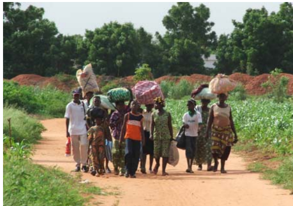
Togolese new arrivals in Ghana UNHCR / L. Quarshie / May 2005

According to the preliminary conclusions of the joint UNHCR/ WFP/ UNICEF assessment mission, the inflow of refugees appears to be broadly presenting two different situations, mainly along north/south lines : in the central and northern districts, host communities live in remote areas far from road access and are predominantly rural, as are the majority of refugees who have fled there, bringing little or nothing with them.