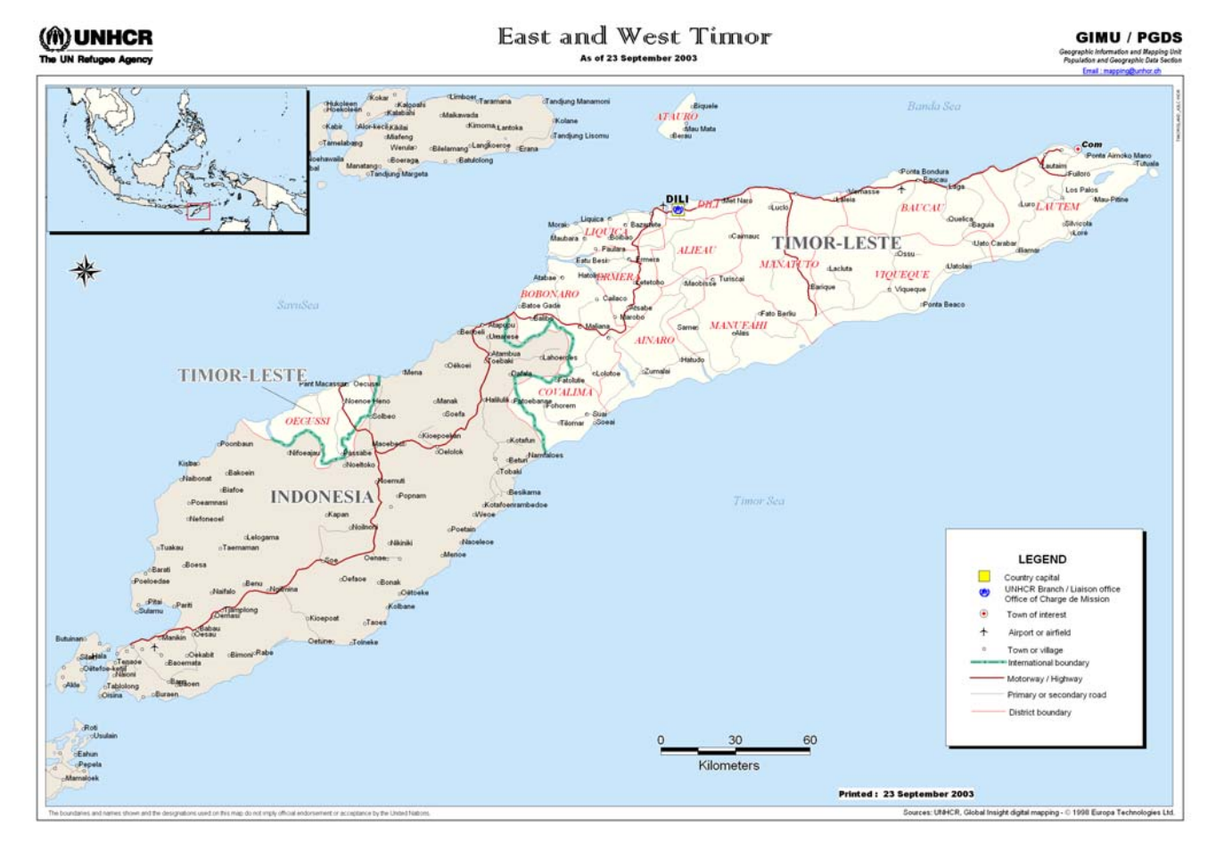
Annex E: Map of East and West Timor