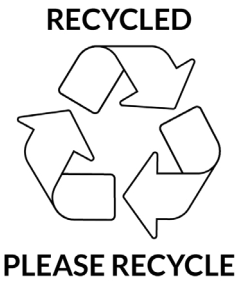
Graphic 1: Recycled Paper Symbol

Every box made of recycled paper must have a symbol about its recycled nature and the possibility to be recycled (see Graphic 1):