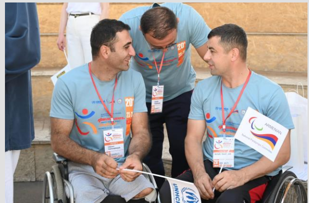
Para-athletes during the opening ceremony of the festival, Yerevan, Armenia.

UNHCR together with the Government of Armenia has started developing a plan aimed at bridging the humanitarian-development nexus , to address humanitarian needs and advance refugee inclusion into government systems and development plans. It will outline specific actions to be undertaken by partners in 2024 and beyond. During this transition phase, the government will gradually expand programs, allocate funding, and mobilize additional resources towards effective refugee inclusion. Humanitarian and development partners will work together to strengthen Government systems to address these humanitarian needs and ensure no one is left behind.