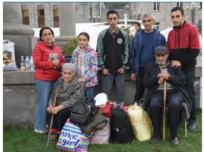
Refugees have just arrived at the reception center in Goris, tired from the three-day journey on the road. 28 September 2023. Goris, Syunik province.

Response: UNHCR scaled up its operation to respond to the urgent lifesaving needs of refugees and facilitate the coordination of the humanitarian response together with the Government. So far, 5,500 individuals were supported with cash assistance, 6,724 households (29,818 individuals) reached through core relief items, 2,291 households (10,473 individuals) reached through protection interventions, and 4134 individuals reached through helpline.