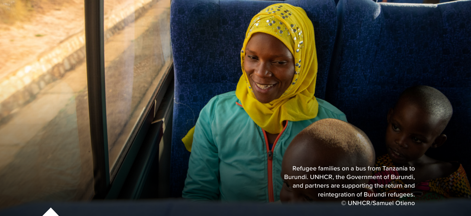
Refugee families on a bus from Tanzania to Burundi. UNHCR, the Government of Burundi, and partners are supporting the return and reintegration of Burundi refugees.

For the benefit of refers to activities in ODA recipient countries with the objective of supporting refugee return and reintegration, including initial voluntary repatriation and reintegration, as well as longer-term sustainable development support