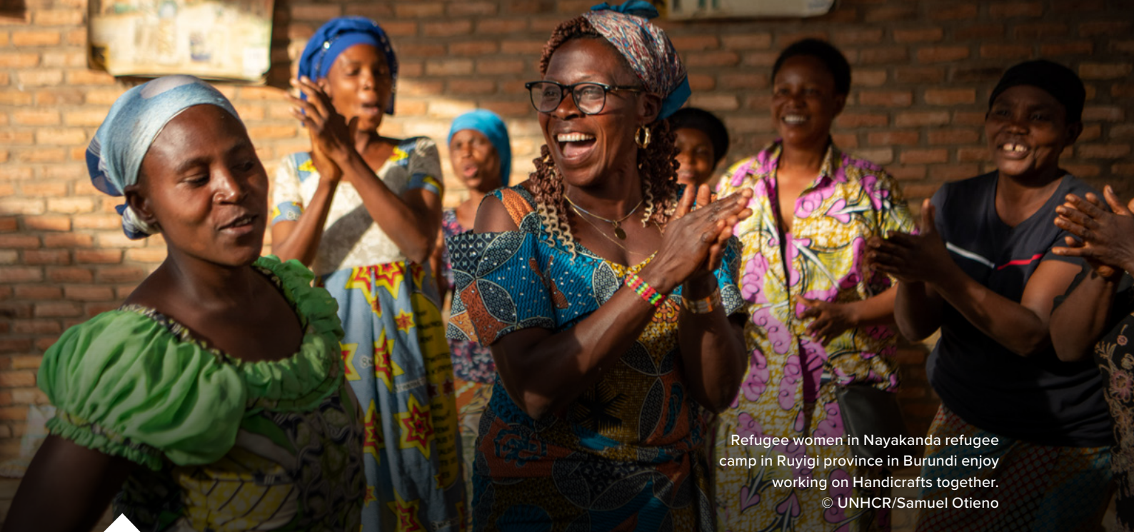
Refugee women in Nayakanda refugee camp in Ruyigi province in Burundi enjoy working on Handicrafts together.