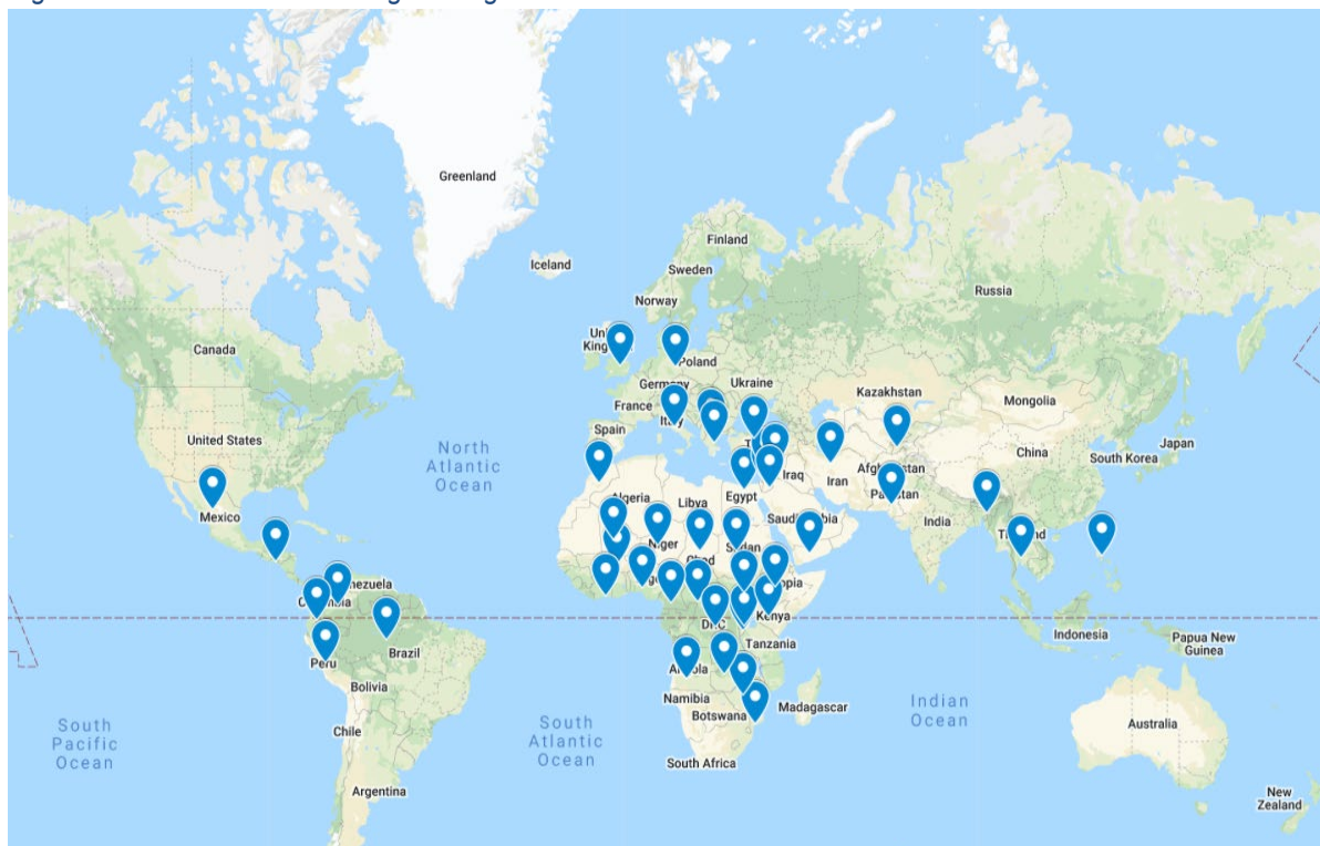
Figure 1: Locations of evidence-gathering

11. Limitations. The main limitation of the synthesis is its dependence on secondary (albeit independent) evaluative evidence rather than direct fieldwork. Accordingly, the synthesis does not claim to represent UNHCR’s full global response to COVID-19, but rather only those aspects and geographies captured by evaluations. Despite its non-comprehensive scope, this synthesis aims to present an accurate, and, it is hoped, useful narrative of UNHCR’s adaptations to meet the challenges of COVID-19 across the world.