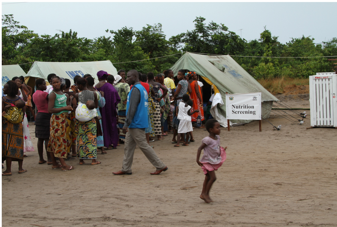
Nutrition screening at the Ampain refugee camp, Ghana.