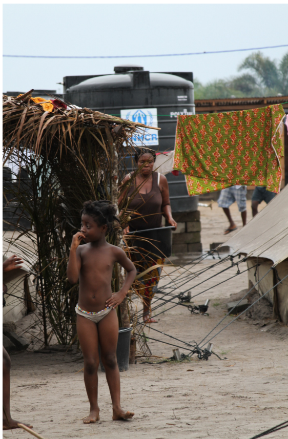
Girl at the Ampain refugee camp, Ghana.