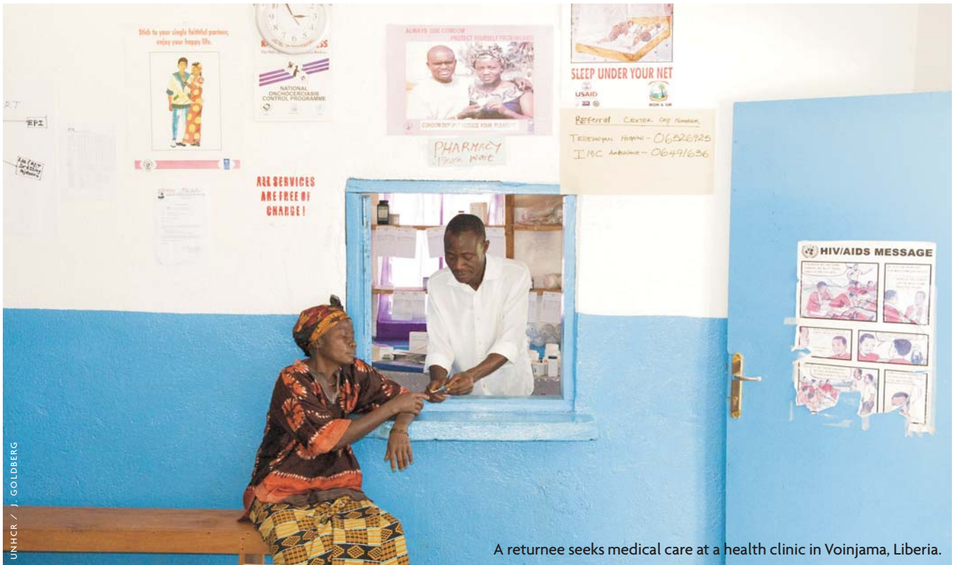
A returnee seeks medical care at a health clinic in Voinjama, Liberia.

country's creditors have cancelled up to USD 4 billion of its debt. Liberia has now qualified to borrow money from the World Bank for the reconstruction of major infrastructure, including roads, power stations and water supplies.