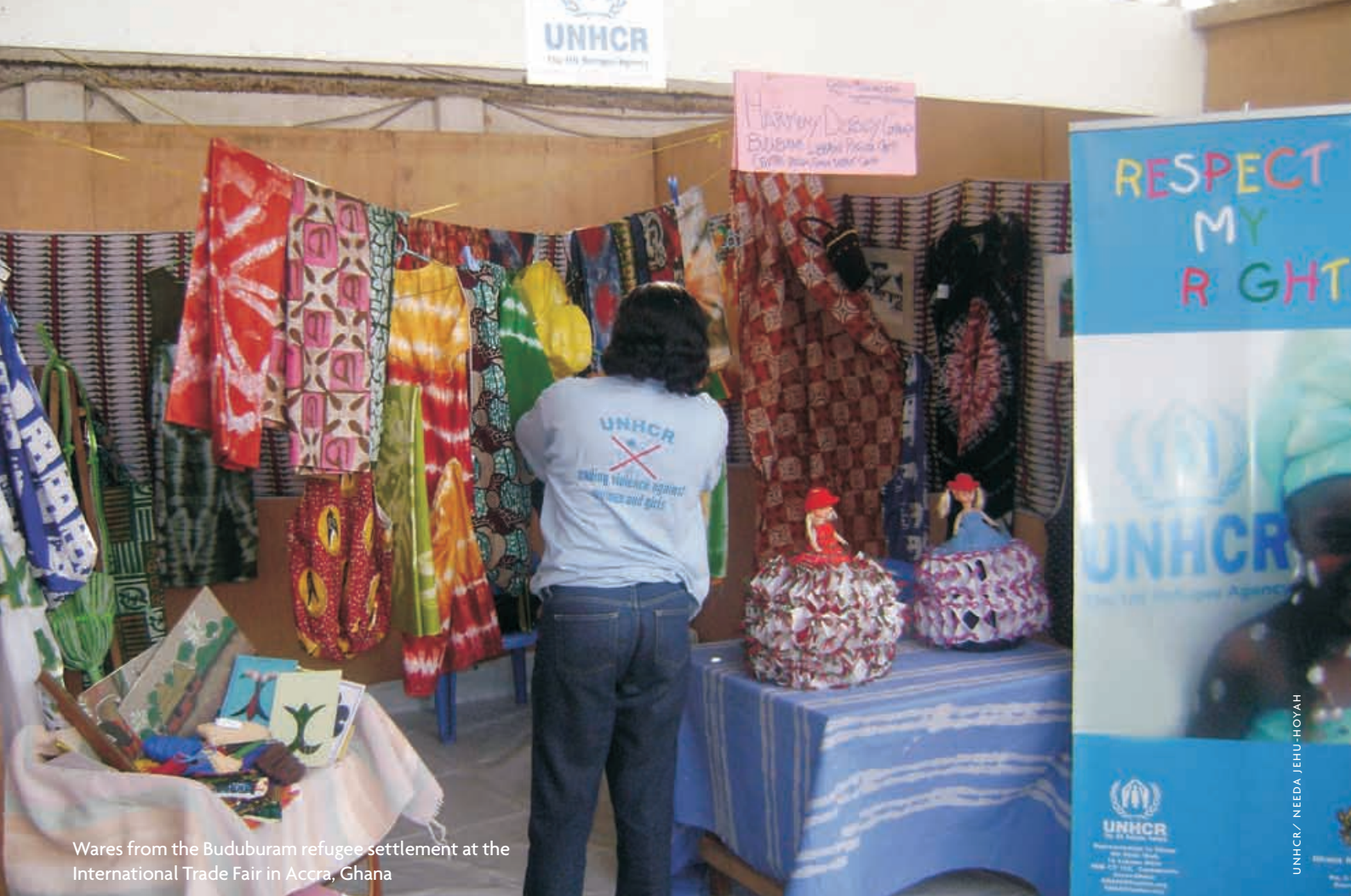
Wares from the Buduburam refugee settlement at the International Trade Fair in Accra, Ghana