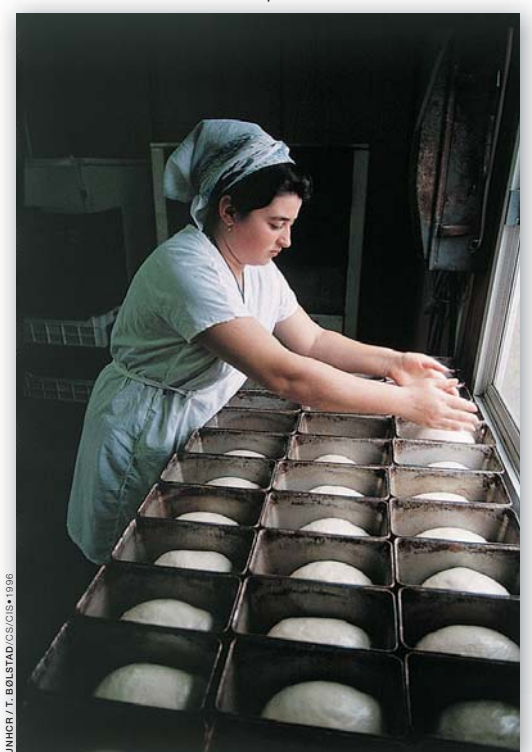
Training can lead to jobs when women return home — work in a bakery in Chechnya.

Our approach is based on involving our partners as closely as possible in the development of WLL