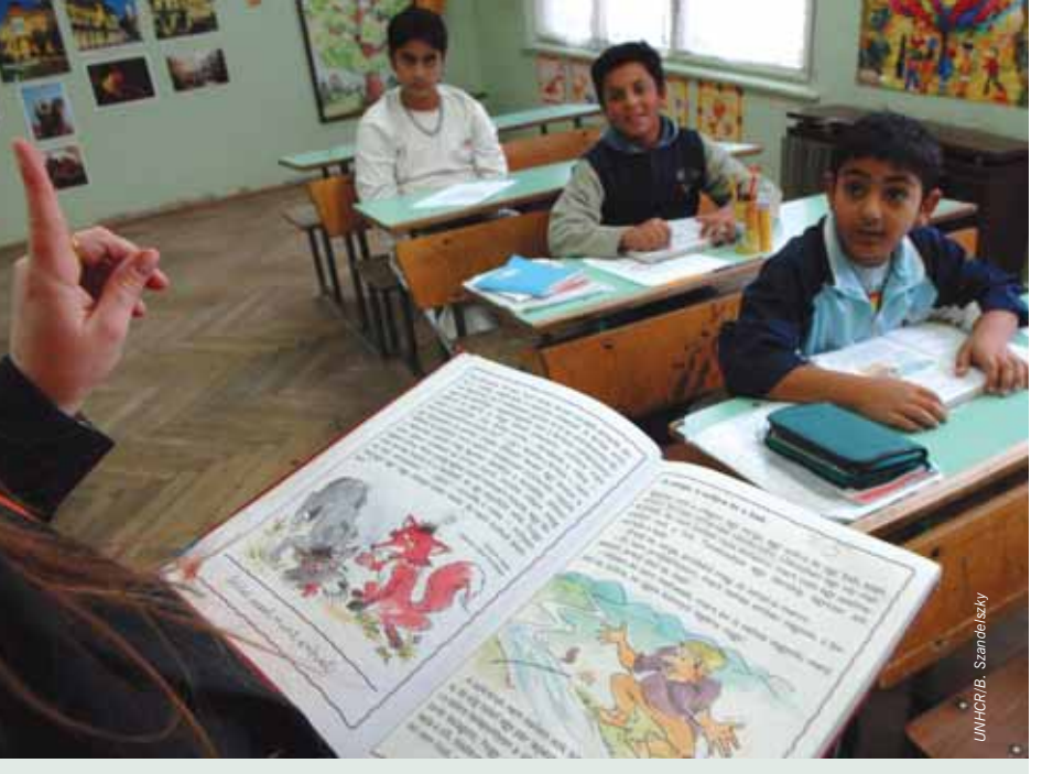
Asylum-seeker and refugee children study in a primary school in Debrecen, Hungary.

The primary durable solution for refugees in the region continued to be local integration. However, refugees continue to face obstacles to integration due to difficulties in learning the national language, finding jobs, acquiring housing and accessing social services. Increasing levels of xenophobia further exacerbated the situation.