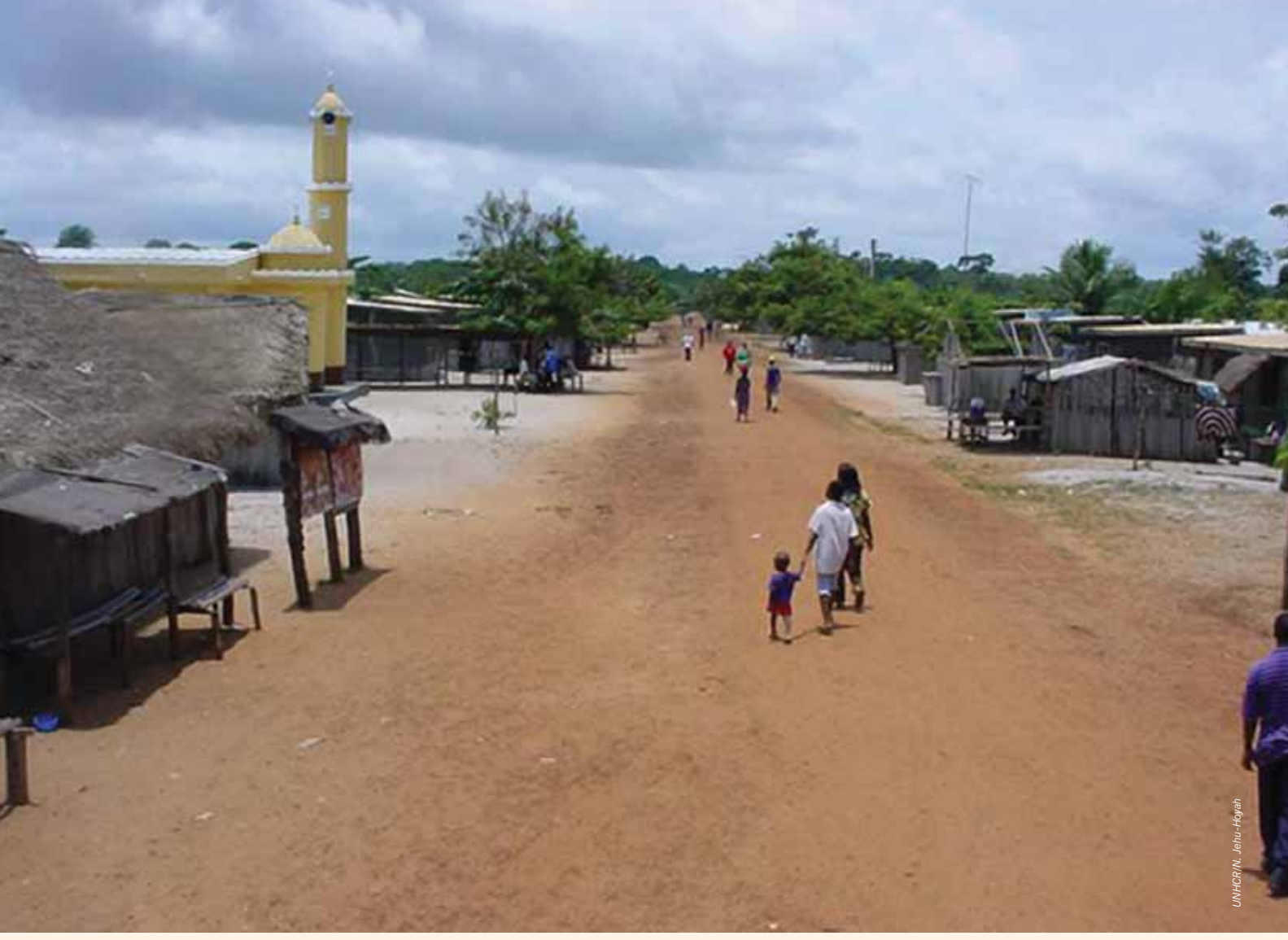
Krisan refugee camp, where refugees of different nationalities live together.