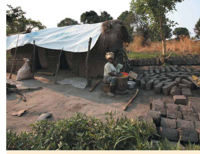
Recently returned refugees rebuild their lives with UNHCR's help.

Protect and assist refugees and strengthen the capacity of national institutions dealing with refugees.