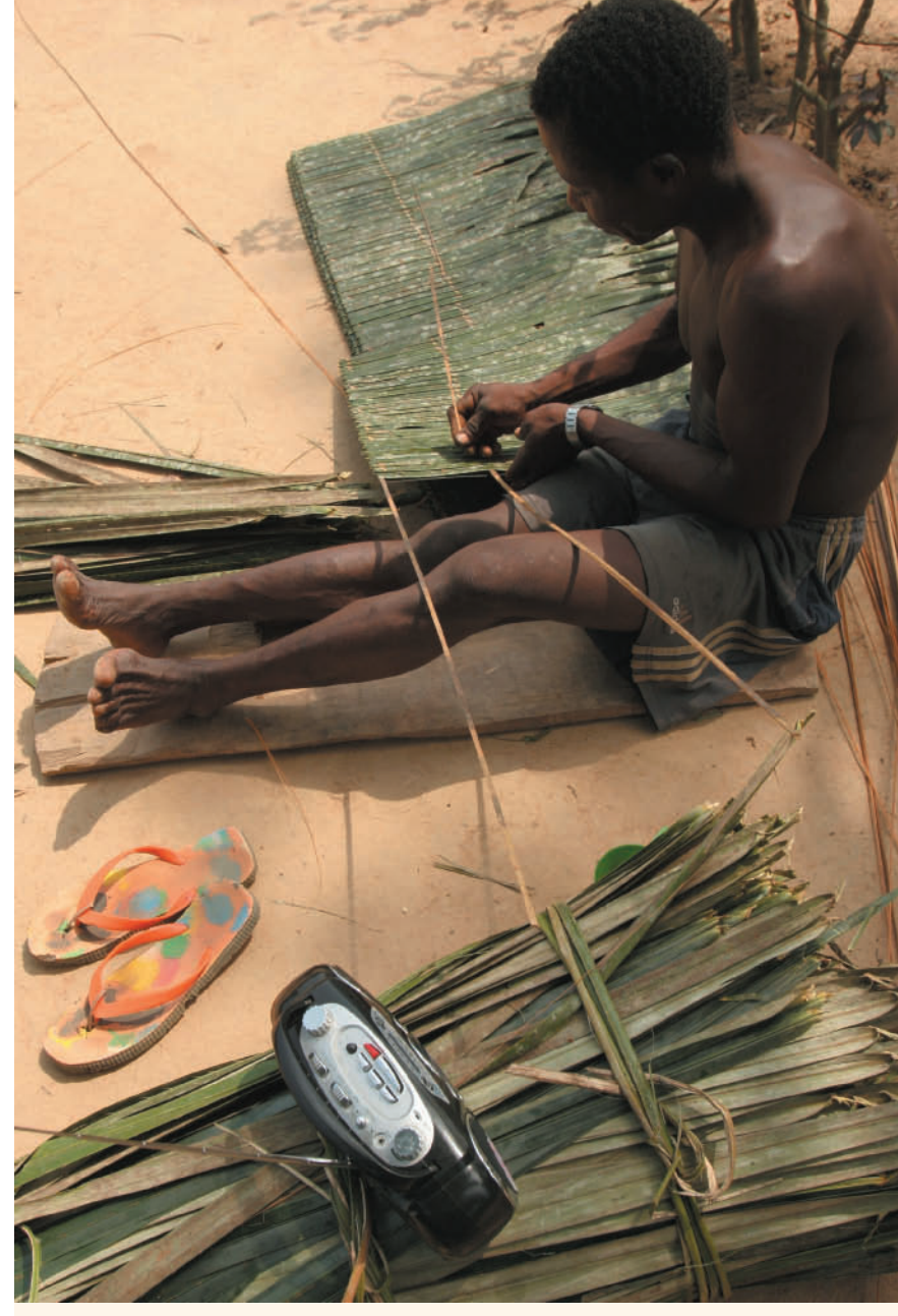
A refugee man from the Democratic Republic of the Congo mends the roof of his hut at a refugee settlement in the village of Malebo.

Health and nutrition: Most of the refugees had access to health care in more than 20 health posts, mobile clinics and through the work of 15 trained health committees. The mortality rate and the crude mortality rate were below the indicated standard rates. The Bamako