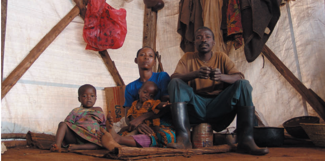
A family of Rwandan asylum-seekers sheltered at Songore transit centre. In 2005, thousands of asylum-seekers arrived in Burundi and received assistance from UNHCR.