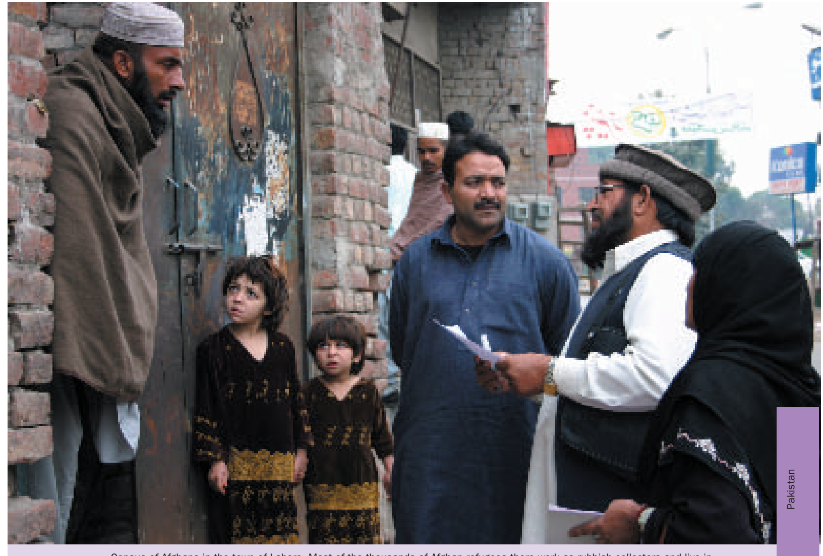
Census of Afghans in the town of Lahore. Most of the thousands of Afghan refugees there work as rubbish collectors and live in a slum by the Ravi river.