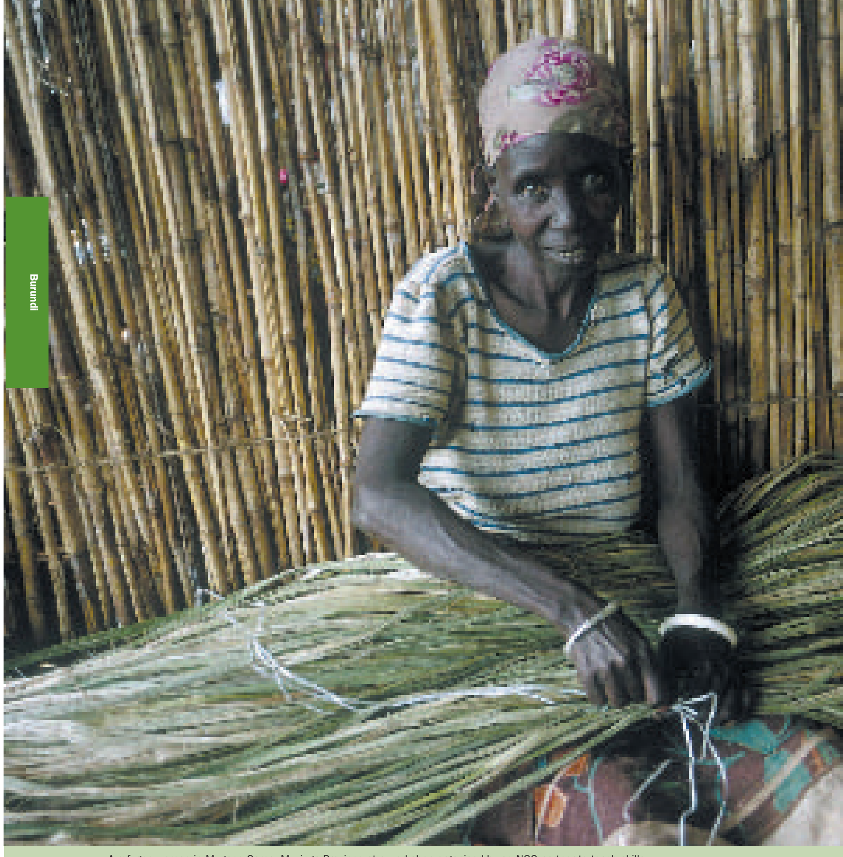
A refugee woman in Mugano Camp, Muyinga Province at a workshop organised by an NGO partner to teach skills in self-sufficiency.