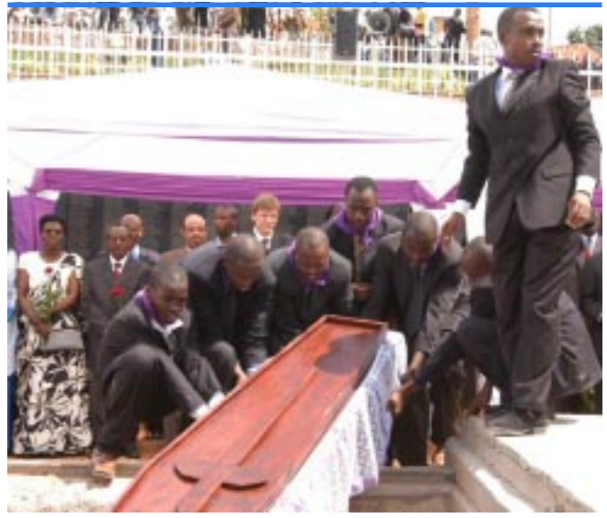
Ready to live together even after all the pain – Rwandans buried the remains of genocide victims at the Gisozi Memorial during the 10th anniversary of the genocide.

However ten years are too short for a crime such as genocide to recede in memory. The wounds are still too fresh. Many who lost their families say they understand the need to forgive and