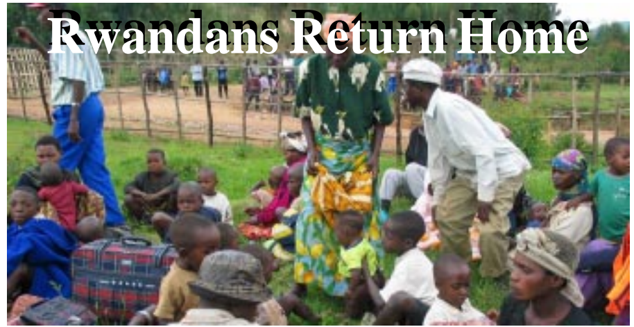
Glad to be back home - Returnees at the Byumba Transit Center.

Cessation Clause: For those refugees that opt to remain in their countries of refuge, a time may come when the UNHCR applies the Cessation Clause; this means Rwandan refugees will have to undergo individual refugee status determination as they will not be recognised by virtue of belonging to a group any longer. The UNHCR will announce when it will invoke the Cessation Clause in advance. Once the Cessation Clause is applied, everyone will be require to prove that they are still in need of international protection or regularise their stay in their country of refugee in accordance with local immigration regulations.