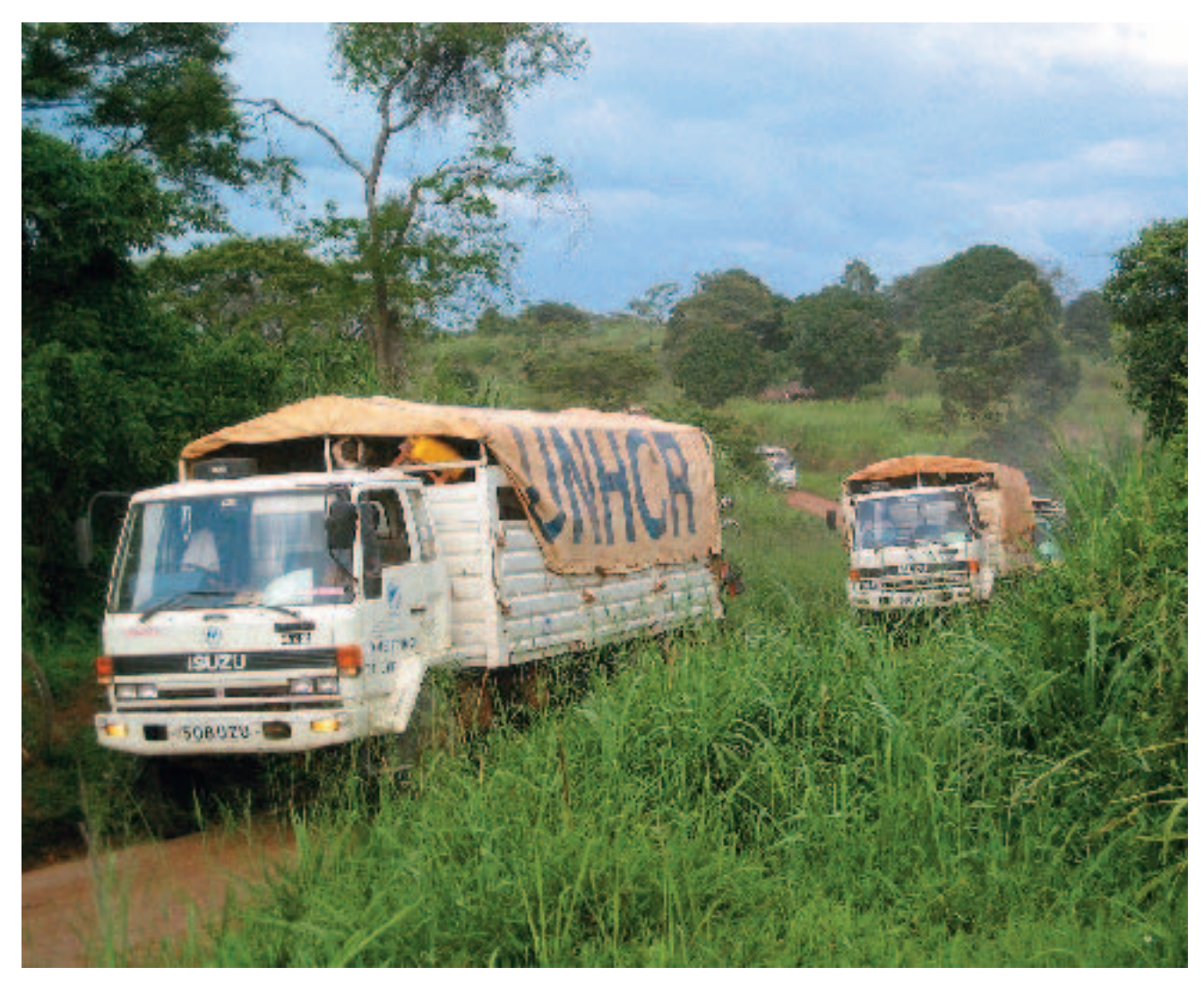
Uganda: Voluntary repatriation – The departure of refugees on their way to their native land, from Kiryandongo, by truck.

UNHCR will intensify its training and discussions with governments, human rights groups and the refugees on various issues related to their well-being. Other priority areas will include: HIV/AIDS initiatives; the combating of practices harmful to women and children; and promoting access to education, including peace education. It is expected that these efforts will improve the quality of