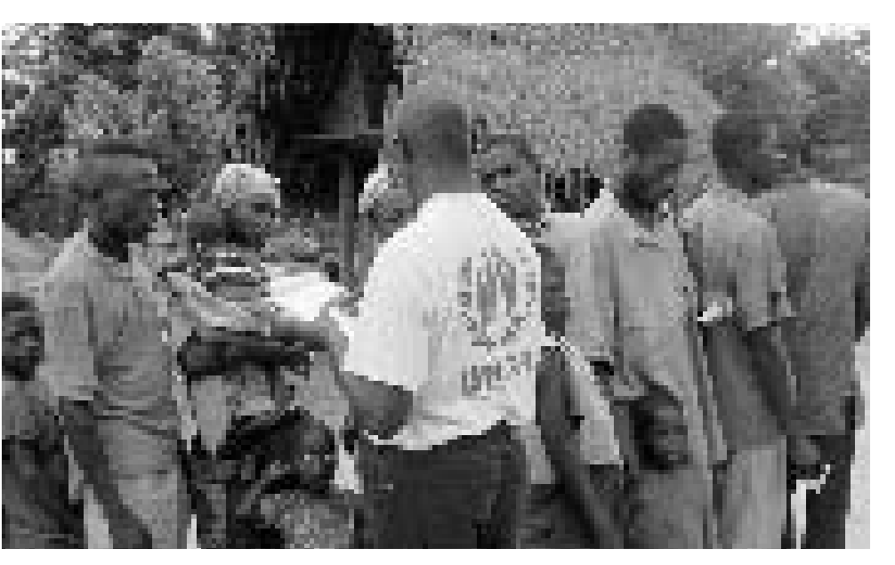
Guinea: Life in exile begins - registration of new arrivals at Sédimay, Macenta.

closed in December 2001. It is estimated that, in 2003, refugees in the four countries covered by the office in Benin will number at least 8,000, most of them from Central African Republic and the Great Lakes region, as well as Nigeria, Togo and East African countries. Given the similarity of living conditions in the four countries, the Office plans to harmonise the activities implemented. Through its partners, UNHCR will support refugees' participation in employment programmes, as well as quick impact projects and micro-credit activities designed to generate employment for refugees and help them to attain self-sufficiency. Vocational training programmes with a direct link to employment will also be considered. UNHCR also plans to support the placement of refugees in employment generation programmes funded by development actors, including other UN agencies. Targeting the most vulnerable refugees, the Office will fund, albeit on a reduced scale, health and primary assistance programmes, such as housing, food, and community services activities.