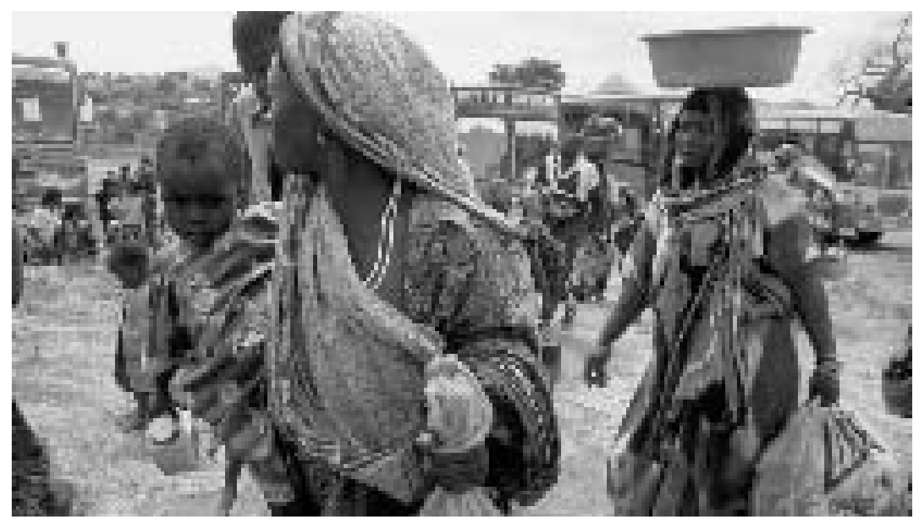
Kenya: Bantus in transit from Dadaab to Kakuma camp, for eventual resettlement to the USA.

Another development, which is of great concern to the region, is the sustainability of food security. The prediction of drought in Ethiopia remains a cause for alarm. It has now been reported that exceptionally dry weather in Ethiopia has doubled the number of people in need of emergency assistance from two to four million, with an additional 2.5 million at-risk. In Eritrea, a large number of people, including those who were internally displaced as a result of the war with Ethiopia, are still recipients of the emergency food supplies. The future outlook therefore remains gloomy in both countries, and if the situation is not contained, the region may be faced with a huge crisis.