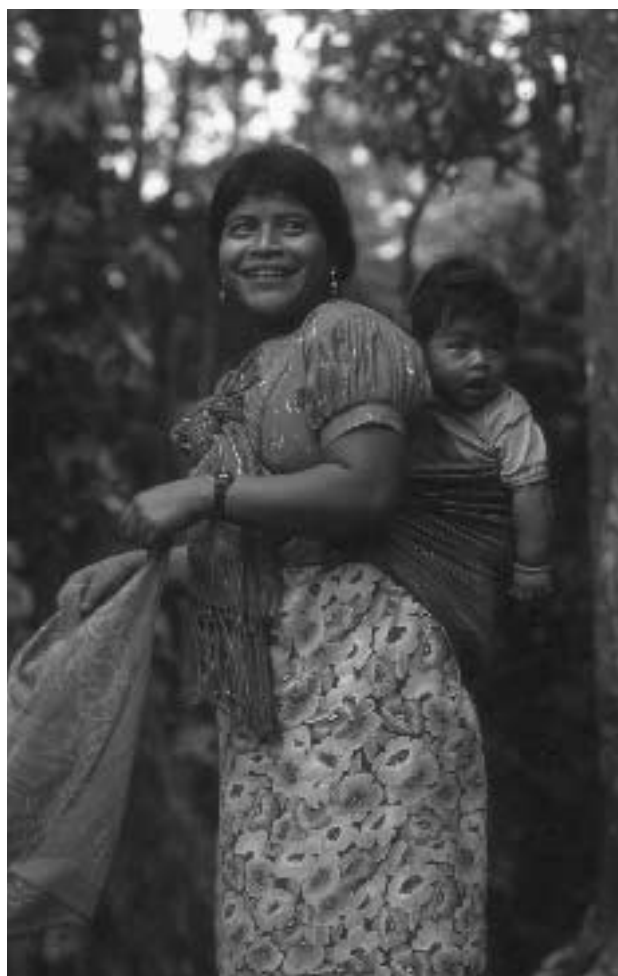
Guatemala: Returnee family.

ment of International Protection. The Spanish website is an important protection and dissemination tool in the Americas and Spain, and includes a legal database.