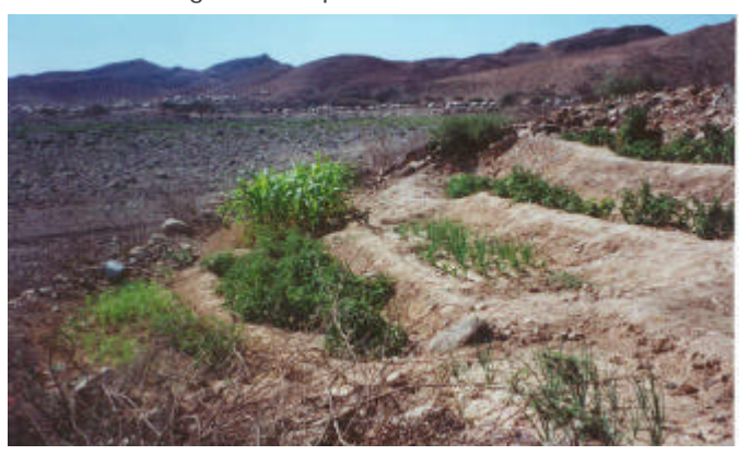
Gravity-fed terraces in Holl-Holl Camp

Refugees in Djibouti have serious problems with the harsh environment, which has a particularly negative impact on the most vul-