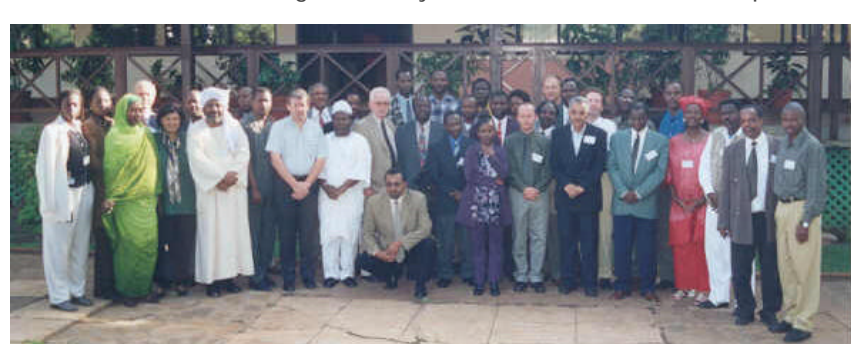
of EE in re- Participants in the Nairobi Environmental Education Workshop

The main workshop objective was information sharing about country experiences in implementing EE projects. Staff from six countries presented overviews of respective projects. Lessons learned and possible solutions to problems were identified through lively discussions.