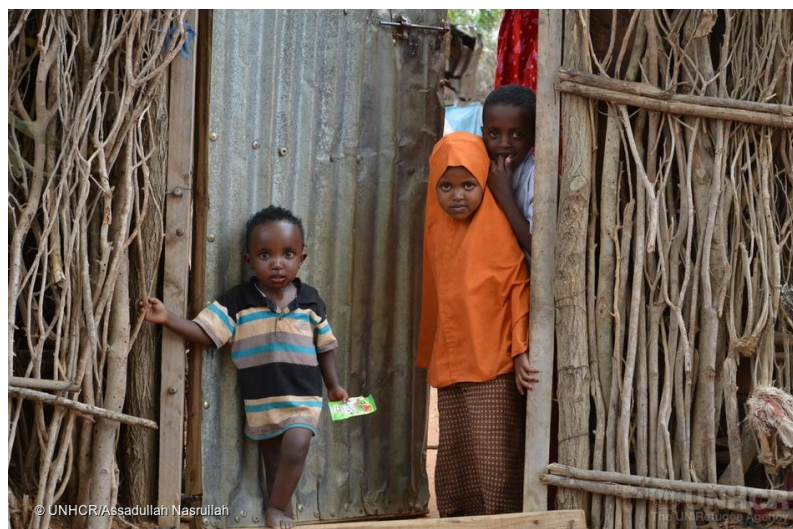
Refugee siblings from Somalia at the door of their house in Hagadera camp of Dadaab.